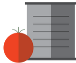
Canned tomatoes (whole, diced, crushed)