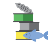
Canned fish (tuna, salmon, sardines)